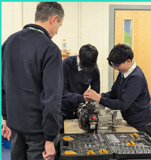
Trevor and Heath End School students learning about the Four Stroke Engine and Cycle